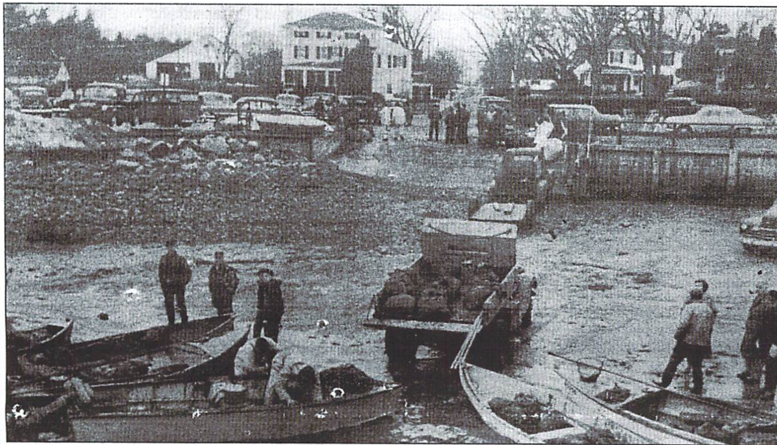
The town landing at Mattakeesett Court dates to 1900 and its road to 1902. In the 1950s Mattakeesett Court was used to land scallops.

The committee warned the town fathers to take action and "bestir yourselves to acquire outlets to the bay, [or] the shore will be closed to the public from Josselyn Avenue to the Kingston line."